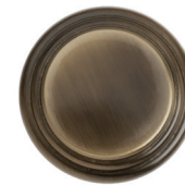
Polished antique bronze