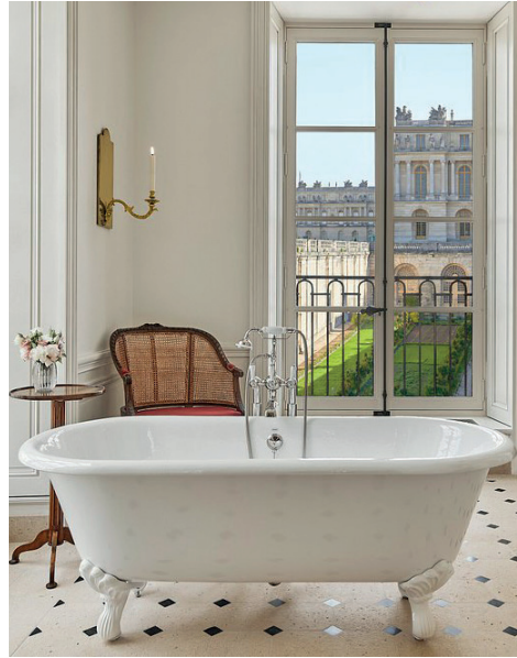
Hôtel Le Grand Contrôle Château de Versailles