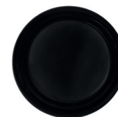
Matt black bronze