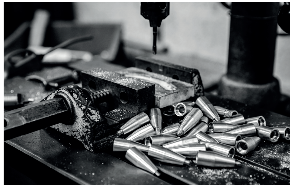
Margot offers more than 30 different finishes

Thanks to Margot's exceptional expertise, the collections are available in some thirty different finishes: from the most traditional, such as chrome or nickel, to the most original. It is also possible to personalise the taps with the help of the wide range of patinas available. They can be adapted to all styles and allow for a certain amount of decorative daring.