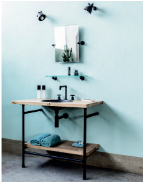
Industry collection