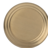
Matt soft gold