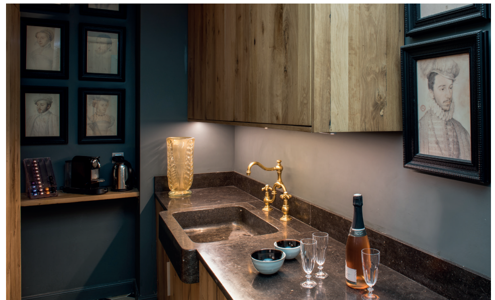
Ile de la Cité project by CM Studio