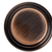
Polished antique copper