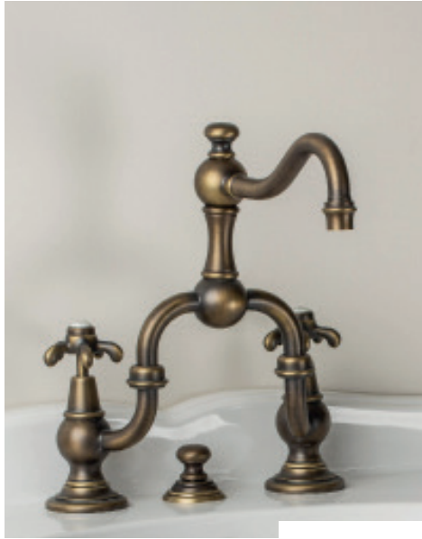
Série 1900 collection