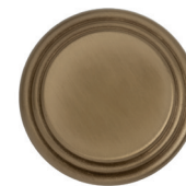
Matt antique bronze