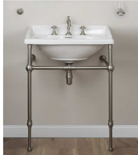
Washbasin, Normandy collection

Nahid Khelfa - Phoebe Taschner-Baldwin nahid@alexandrpr.com - phoebe@alexandrpr.com +33 (0)1 47 58 08 03 - www.alexandrpr.com