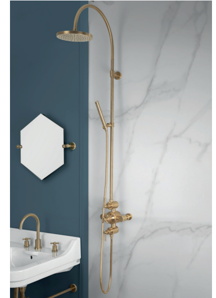
Shower column, Onyx collection